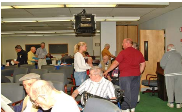
Social time at 28 April Support Group at Richmond VAMC