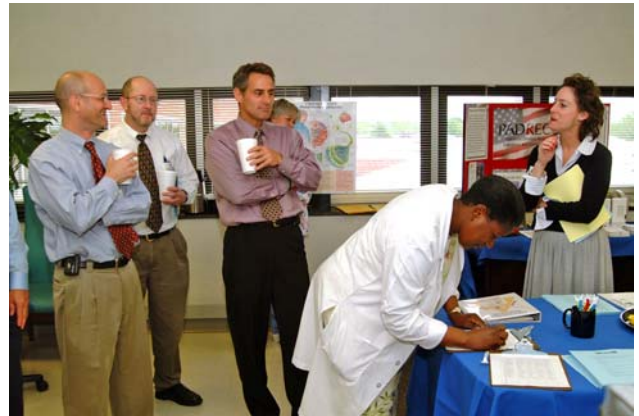
Medical staff at VAMC Richmond earned ½ hour of TEMPO credit for learning about PADRECC & PD at the Open House on 26 April

VAMC Richmond and PADRECC SE acknowledged Parkinson's Disease Awareness Month in April. Activities included the first ever PADRECC Open House. This event gave us an opportunity to showcase our strong clinical base of operations, as well as our research projects and educational programs. Inviting the larger community at Richmond VAMC to get to know PADRECC SE staff is important for clarifying PADRECC identity.