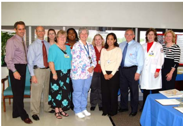
PADRECC Staff hosted an Open House on 26 April for Parkinson's disease Awareness Month