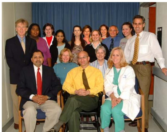
PADRECC SE Staff