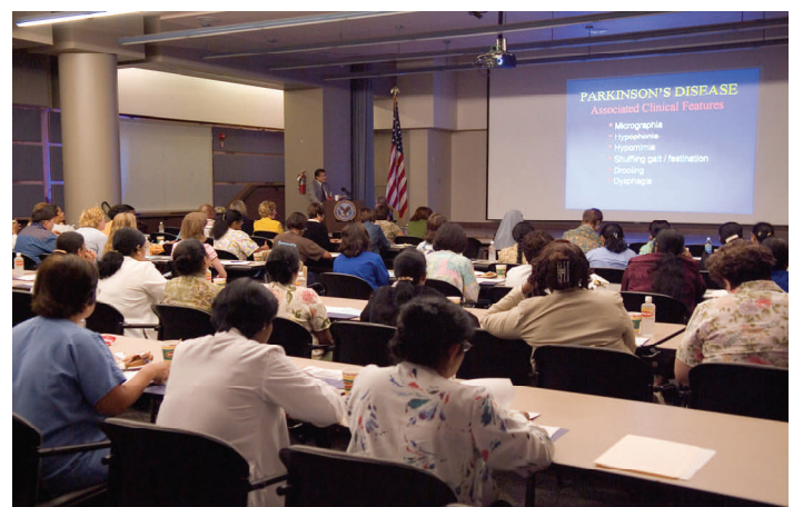
The PADRECC Allied Health Education Committee planned, organized, and sponsored a 1-day continuing education conference on caring for patients with PD for VA and Houston area nurses on September 29, 2006 at MEDVAMC.

How you sit on your SIT bones is very important, however, because too often we let the pelvis rotate backwards, which puts more pressure on your buttocks area and keeps the lower back into a rounded