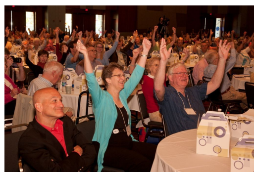
The Victory Salute to celebrate moments of victory