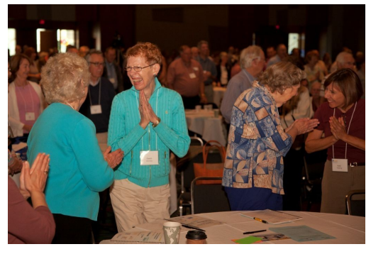
Practicing laughter yoga